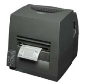
Printers, paper and labels